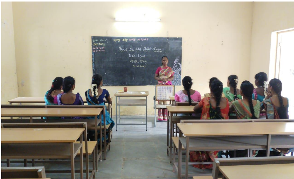
Meeting with B.Ed. I year hostel students on 31.10.2023.