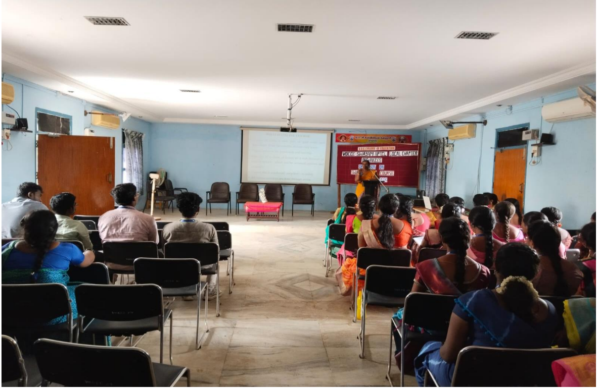
Our college organized an orientation programme on “Swayam Online Course” for B.Ed. I year students on 09.01.2024.