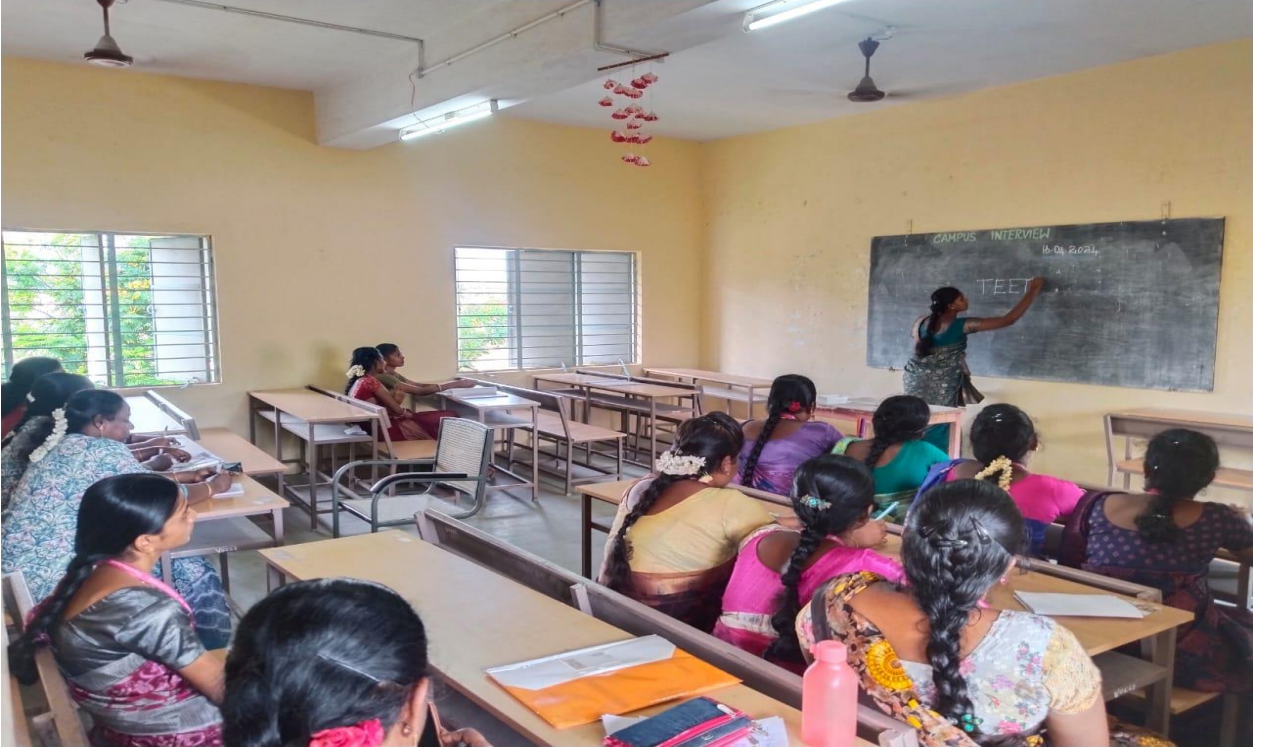
The Campus Interview was held on 16.04.2024 at our college for recruiting teachers for Johnson Nursery and Primary school, Thoothukudi.