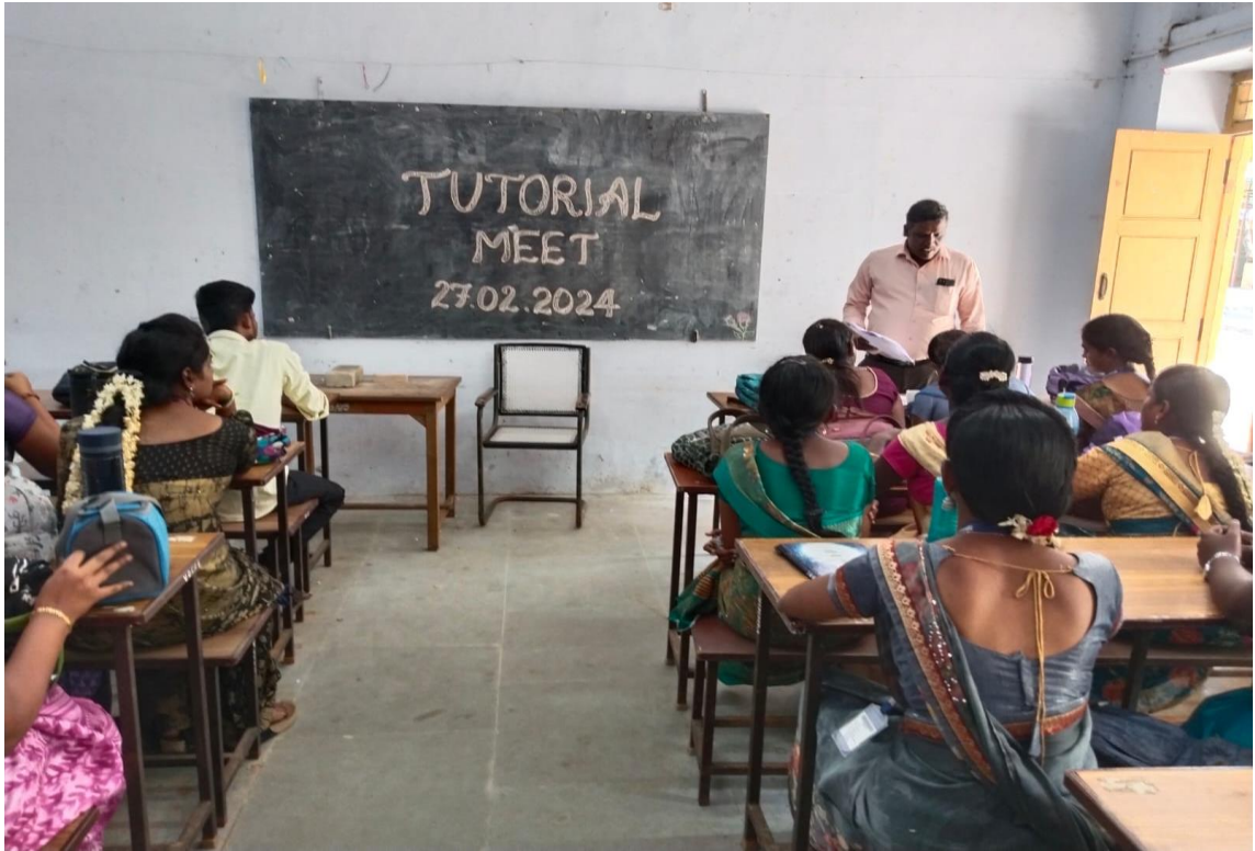
Our college organized the Tutorial Group Meet for our student-teachers on 27.02.2024.