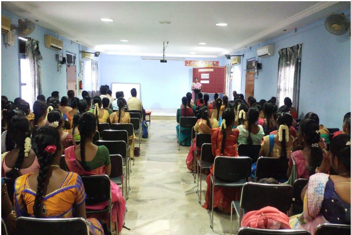
Bridge Course on Communicative Skills was conducted for prospective teachers in our college from 26.09.2023 to 11.10.2023.