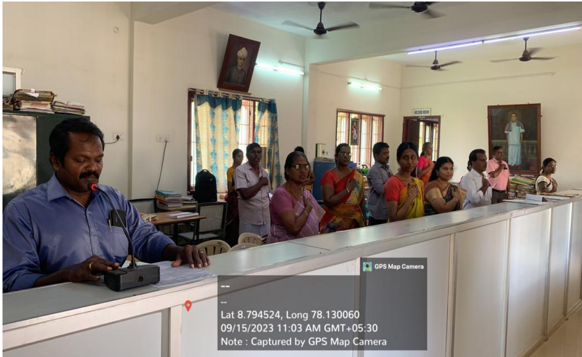
Social Justice Day was observed by pledge taking by our staff on 15.09.2023