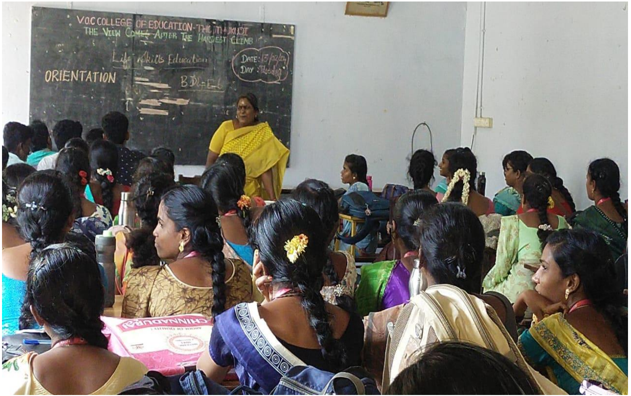
Fourth Semester Orientation for the B.Ed. II year student-teachers was held on 12.02.2024.