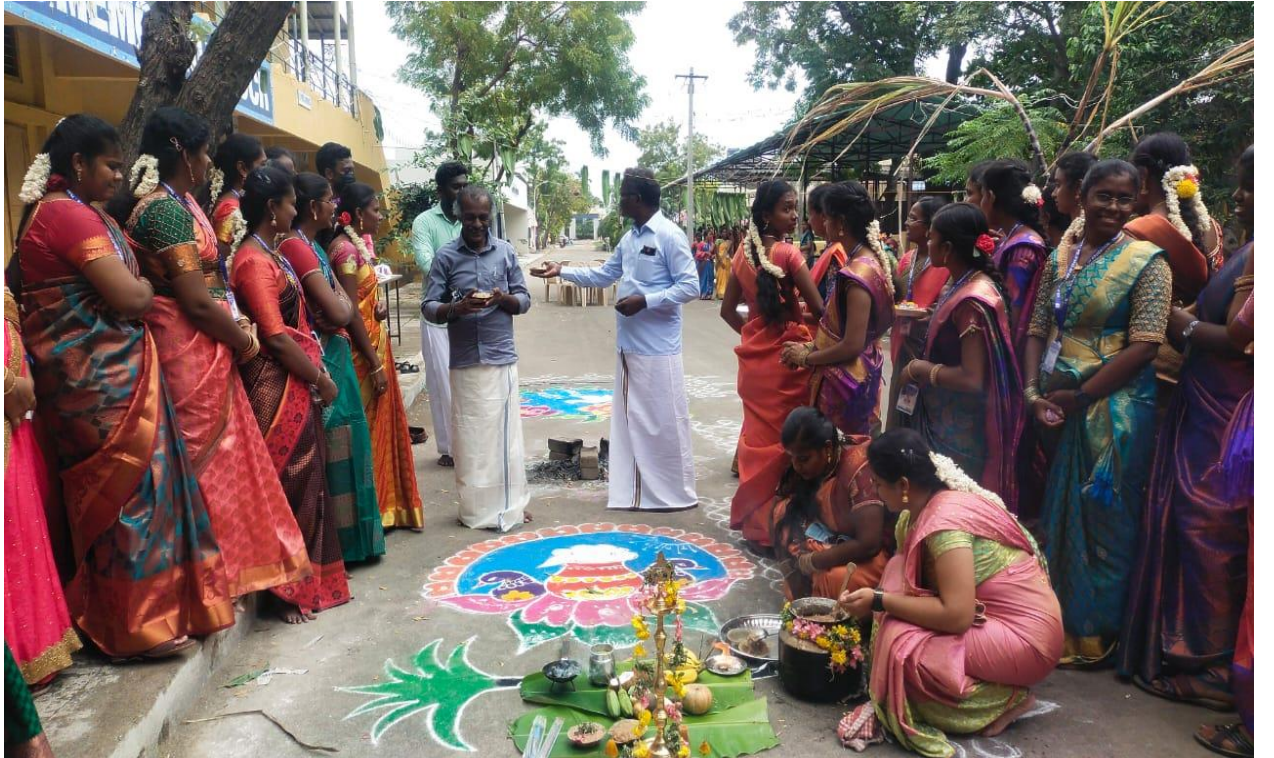
20.01.2024 அன்று பொங்கல் திருவிழா” நமது கல்லூரி வளாகத்தில் கொண்டாடப்பட்டது.