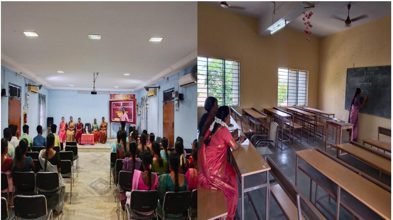
On Campus Interview was held on 21.03.2024 for B.Ed. II year student – teachers by X'an Matriculation Higher Secondary School, Thoothukudi in the college campus.