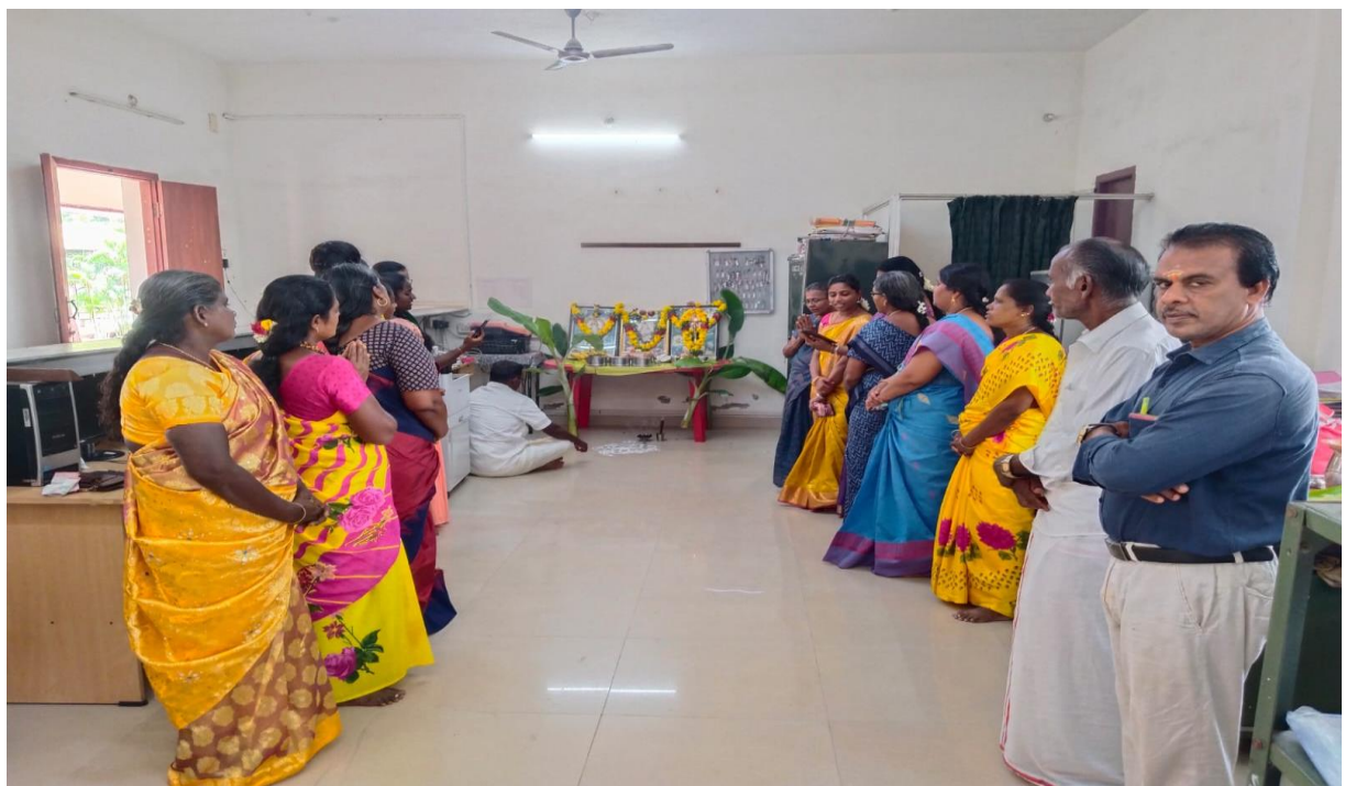
Saraswathi Pooja was celebrated in our college on 23.10.2023.