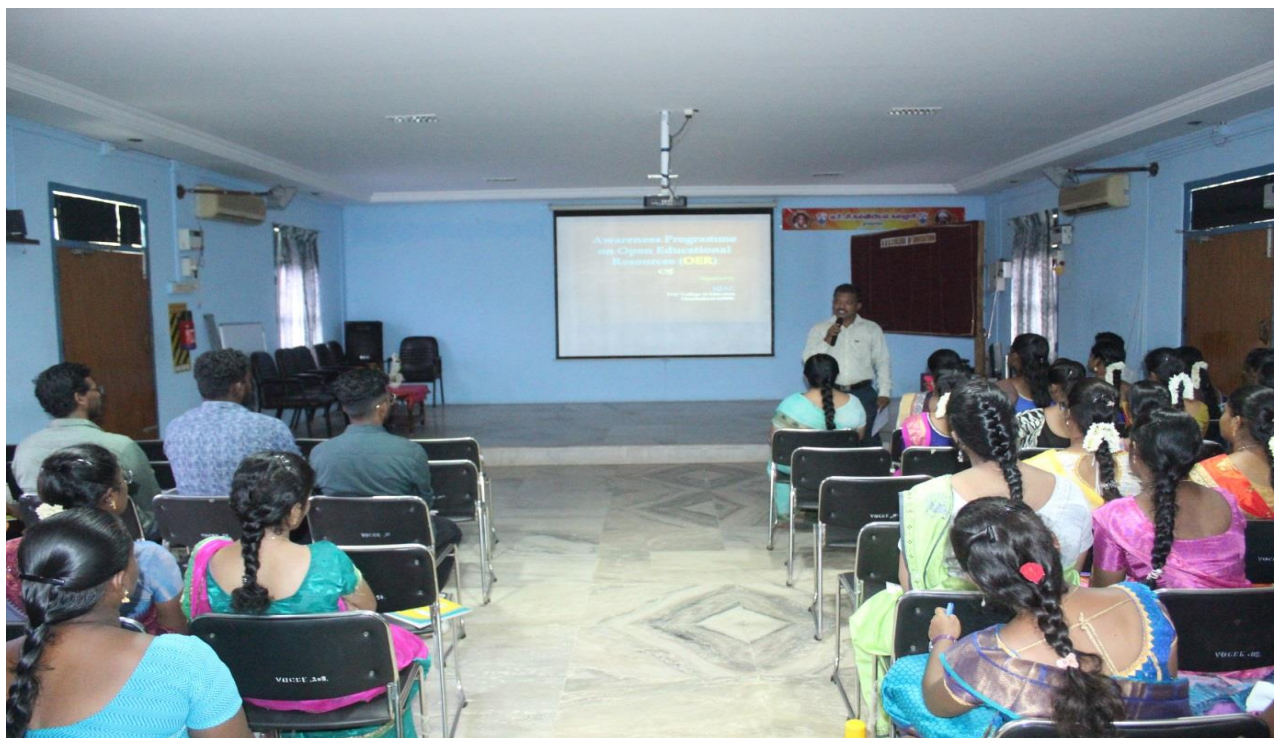
An awareness programme on Open Educational Resources was organized by IQAC of our college on 13.10.2023.