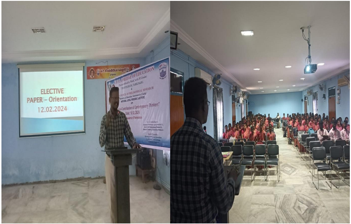
Orientation program on Elective Courses was held for the B.Ed. Fourth semester students on 12.02.2024.