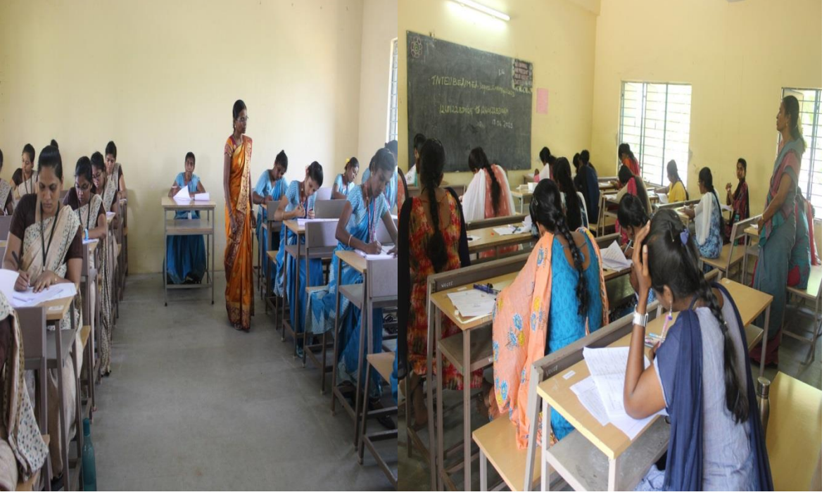
Tamil Nadu Teachers Education University B.Ed./M.Ed. Degree Examination, April 2023 was conducted at our college from 17.04.2023 to 26.04.2023.