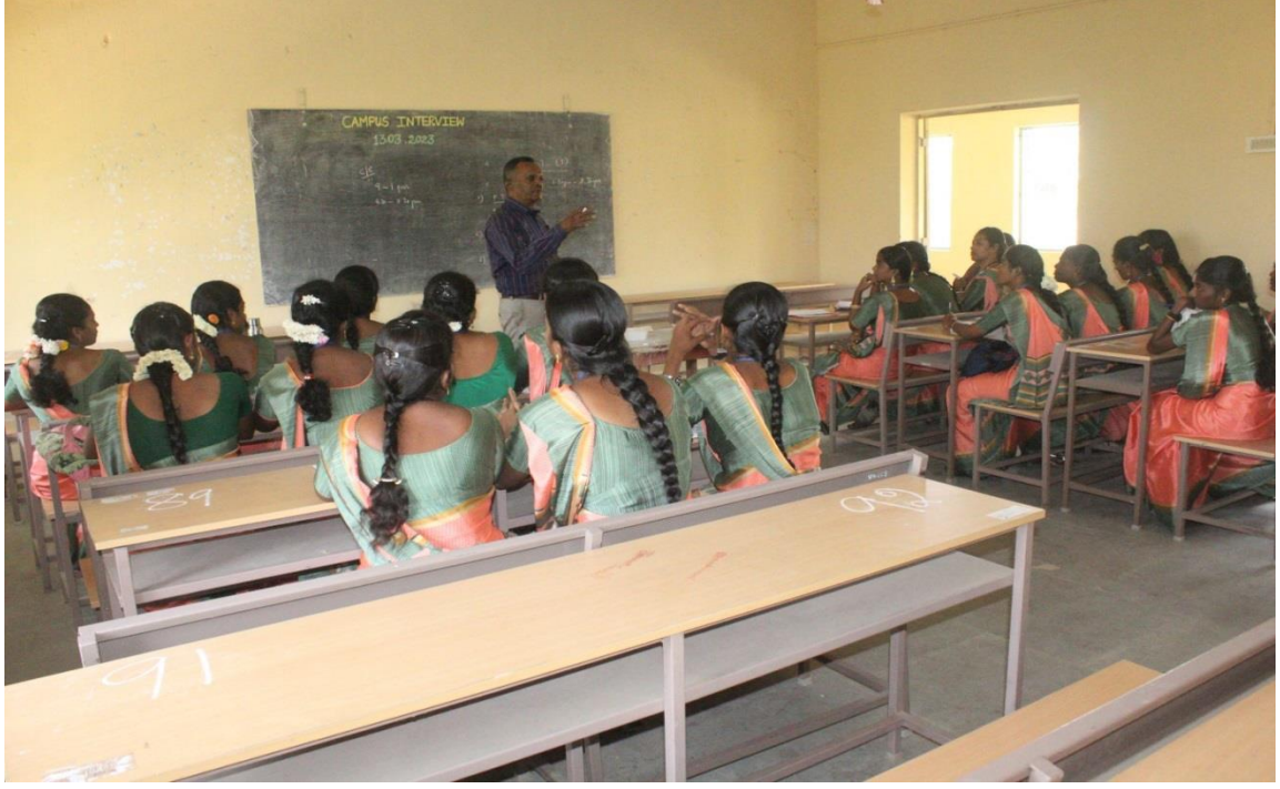
On Campus Interview was conducted by our college on 13.03.2023 for recruiting teachers to Jeenius IIT/JEE Coaching Classes of Thilak Education & Research Foundation.