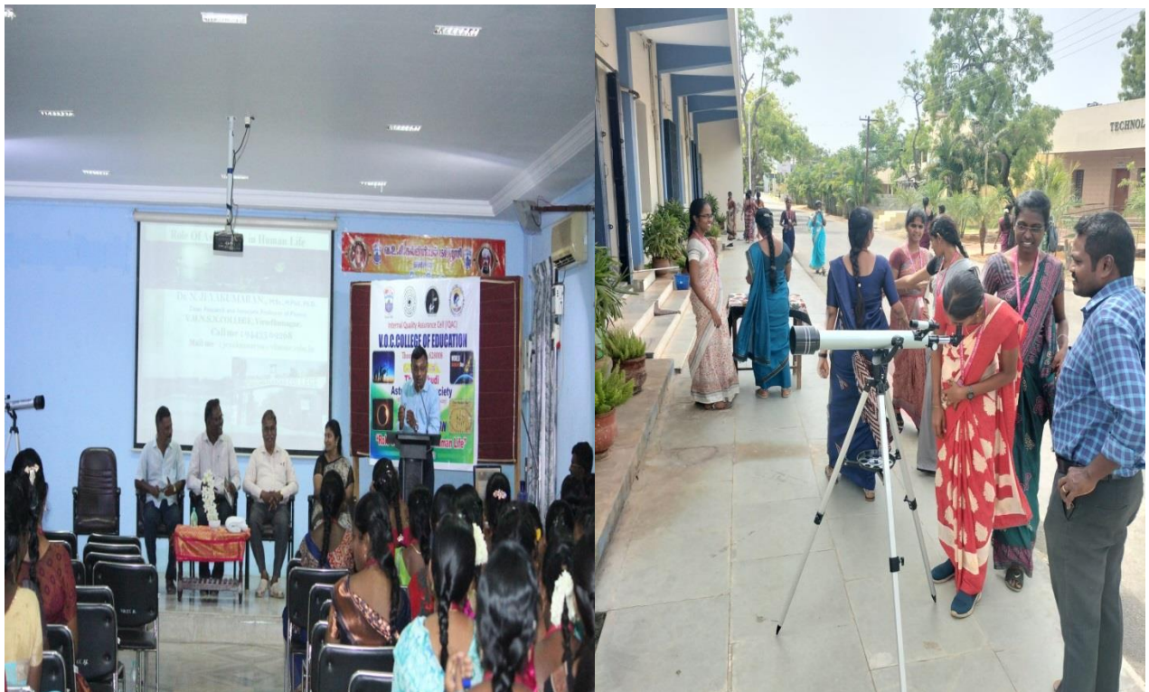
IQAC of our college organized a workshop on “Role of Astronomy in Human Life” on 17.06.2023 in collaboration with Thoothukudi Astro. Science Society, affiliated with Tamilnadu Astronomy Science Society.