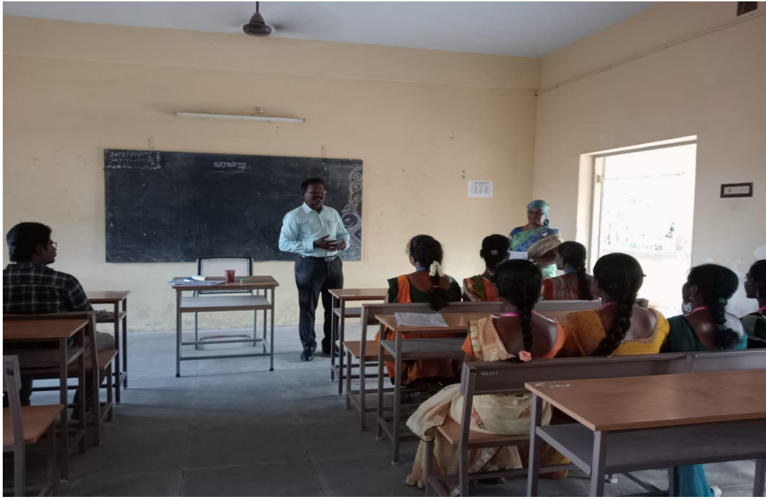
Our college organized a “Counselling Session” for the B.Ed. I and II year hostellers.