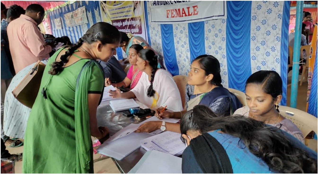
Our student volunteers in the Mega Job Fair at St.Mary's Boys' Higher Secondary School on 25.11.2023.