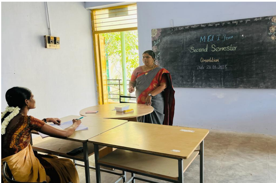
“M.Ed. I year II Semester Course Orientation programme” was held on 20.03.2023 in our college.