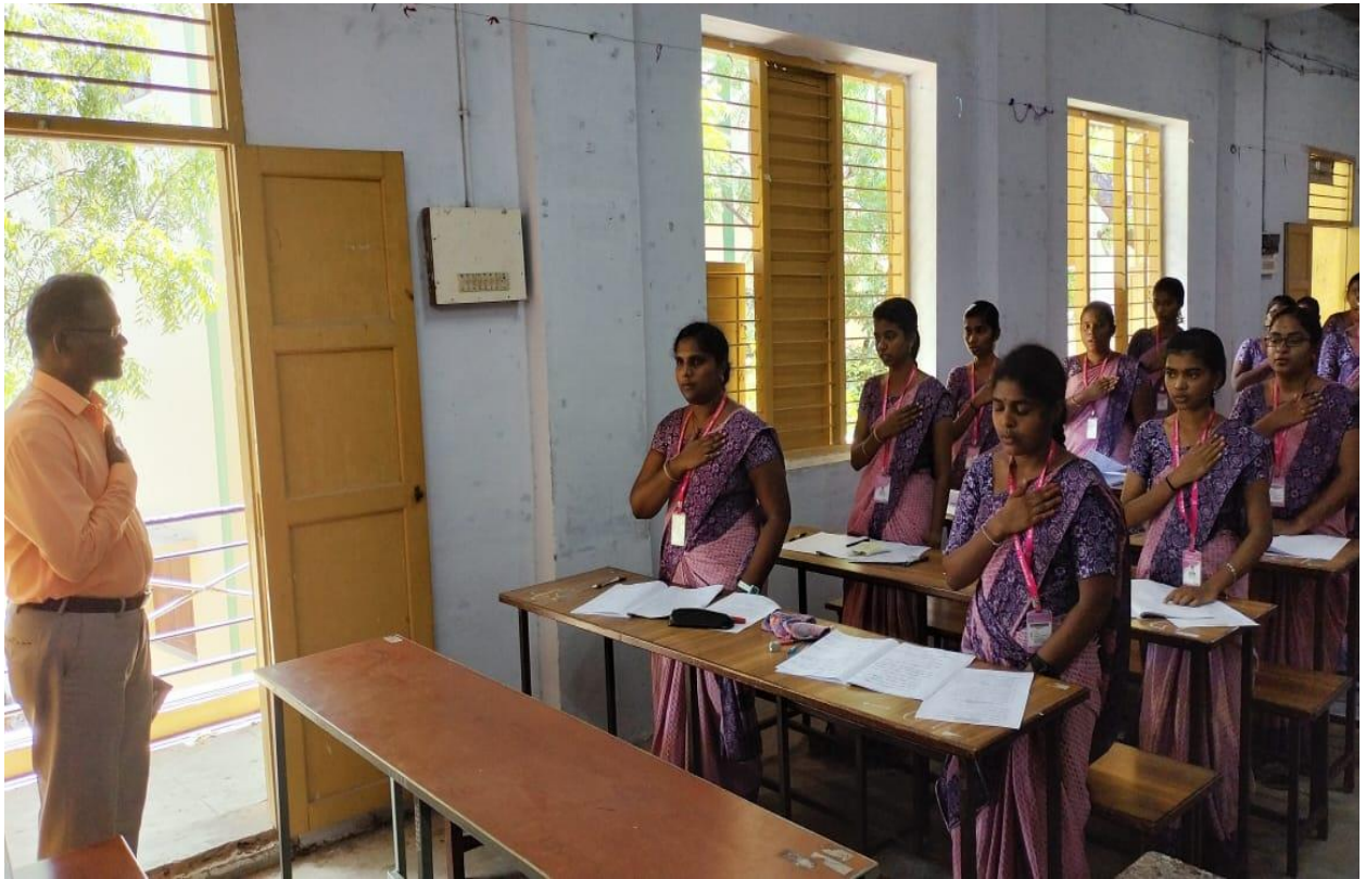
Pledge was taken on account of National Day for Abolition of Child Labour on 12.06.2023.