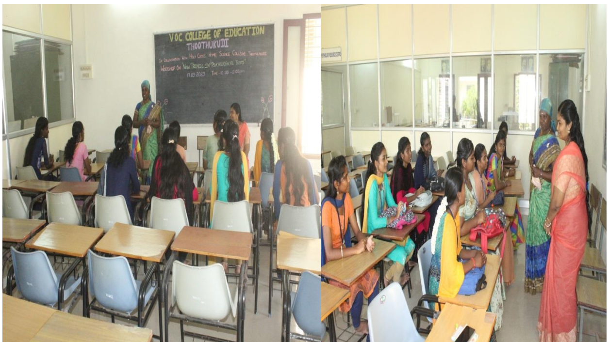
Workshop on “New Trends in Psychological Tests” was conducted by our college on 17.03.2023 for B.Sc. I year Psychology Students of Holy Cross Home Science College, Thoothukudi under MoU.