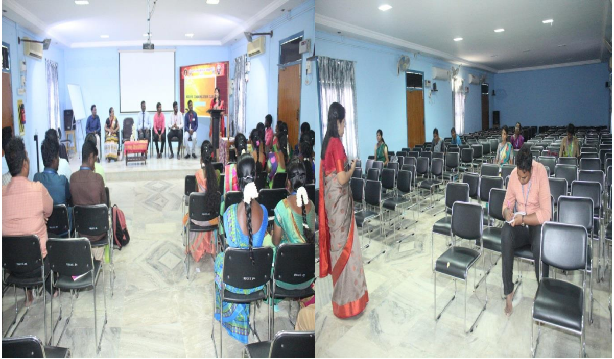
On Campus interview was conducted by our college on 14.03.2023 for recruiting Associate Trainer to Beehive Communication Club Virudhunagar.