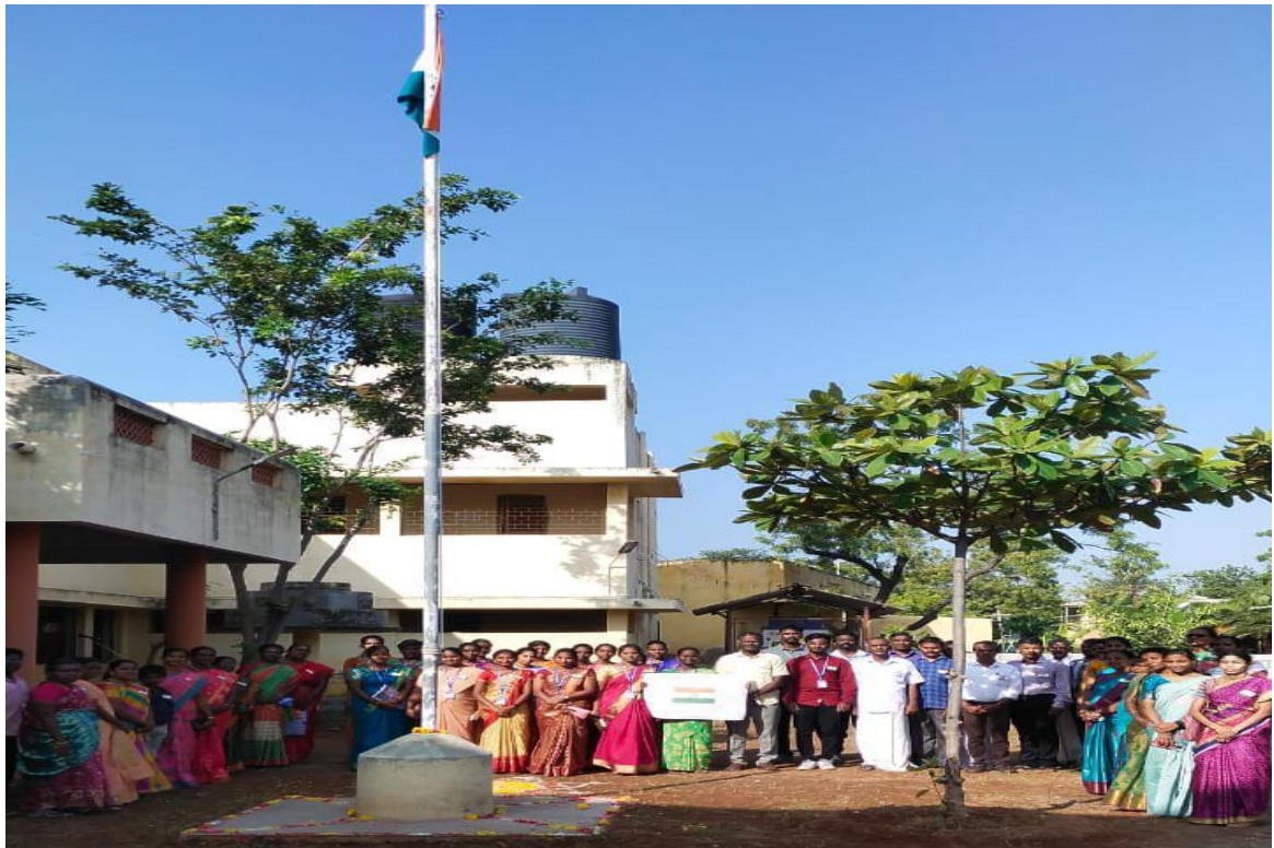
Nation's 75 th Republic Day was celebrated in our college on 26.01.2024.