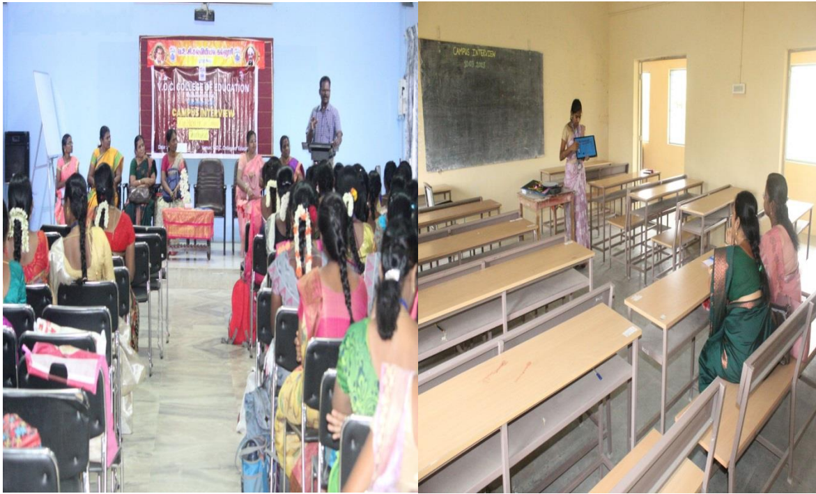
On Campus Interview was conducted by our college on 10.03.2023 for recruiting teachers to X'an Matriculation Higher Secondary School, Thoothukudi.