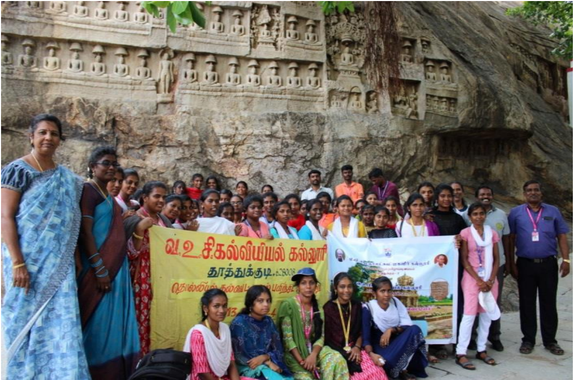
12.04.2024 மற்றும் 13.04.2024 ஆகிய இரு நாட்கள் ஏ.பி.சி. மகாலெட்சுமி மகளிர் கல்லூரியும், வ.உ.சி கல்வியியல் கல்லூரியும் இணைந்து இருநாள் தொல்லியல் கல்வியியல் பயிற்சிப் பட்டறையை நடத்தியது.