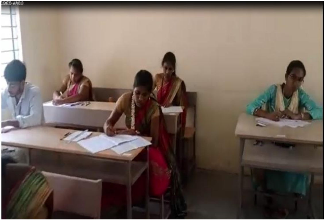
Tamil Nadu Public Service Commission Group – IV Examination was conducted by our college on 24.07.2022.