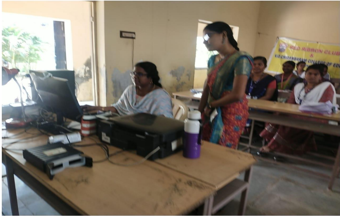
Our college organized an Aadhar Camp in association with Postal Department on 15.03.2024 & 16.03.2024.