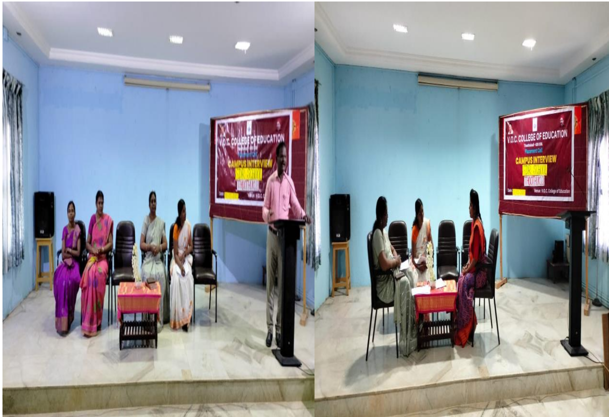
On Campus Interview was organized on 30.03.2023 for recruiting teachers to SDR School, Thoothukudi.