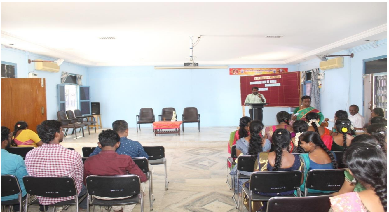
Our college organized a special Lecture on “Fundamentals of Indian Constitution” on account of Constitution Day of India on 24.11.2023.