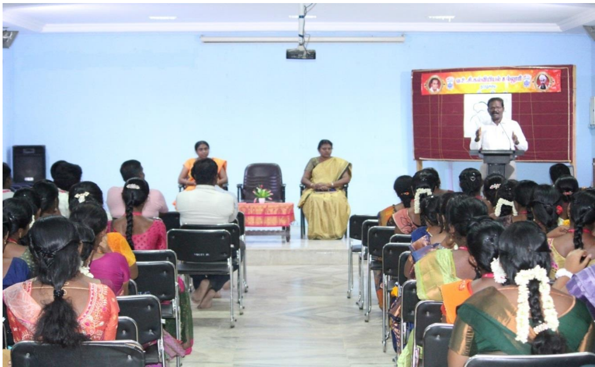
Mother's Day was celebrated by our college on 13.05.2023.