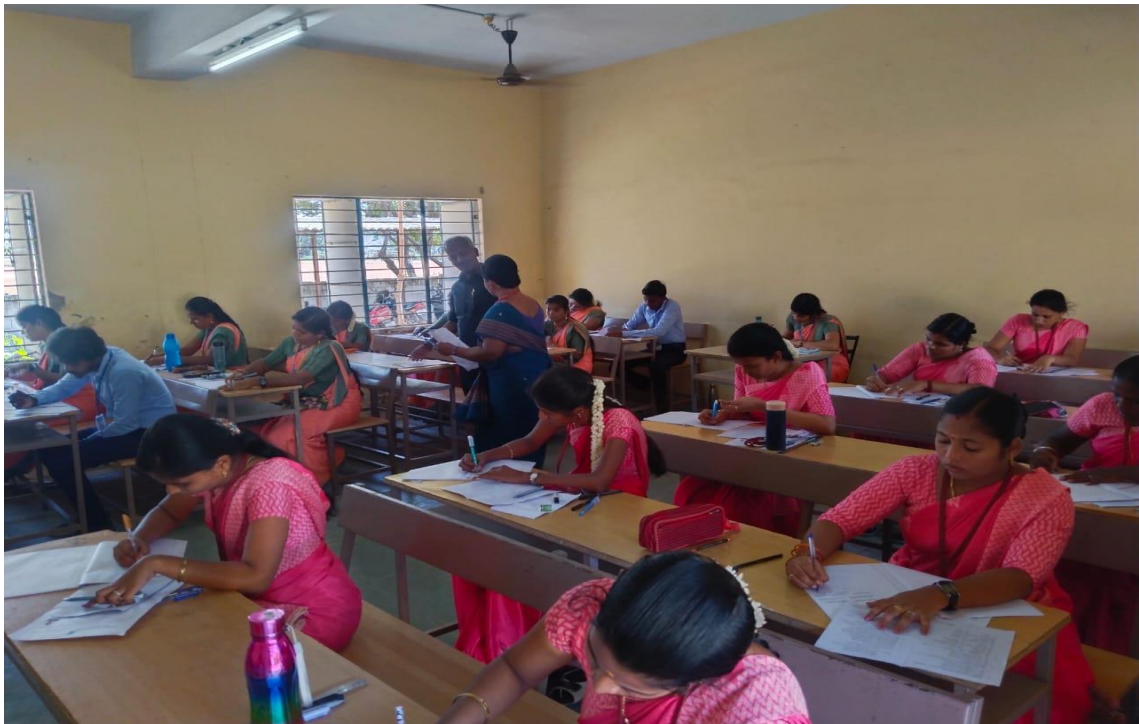
Tamil Nadu Teachers Education University B.Ed./M.Ed. Degree Examination, August 2023 was conducted at our college from 03.08.2023 to 14.08.2023.