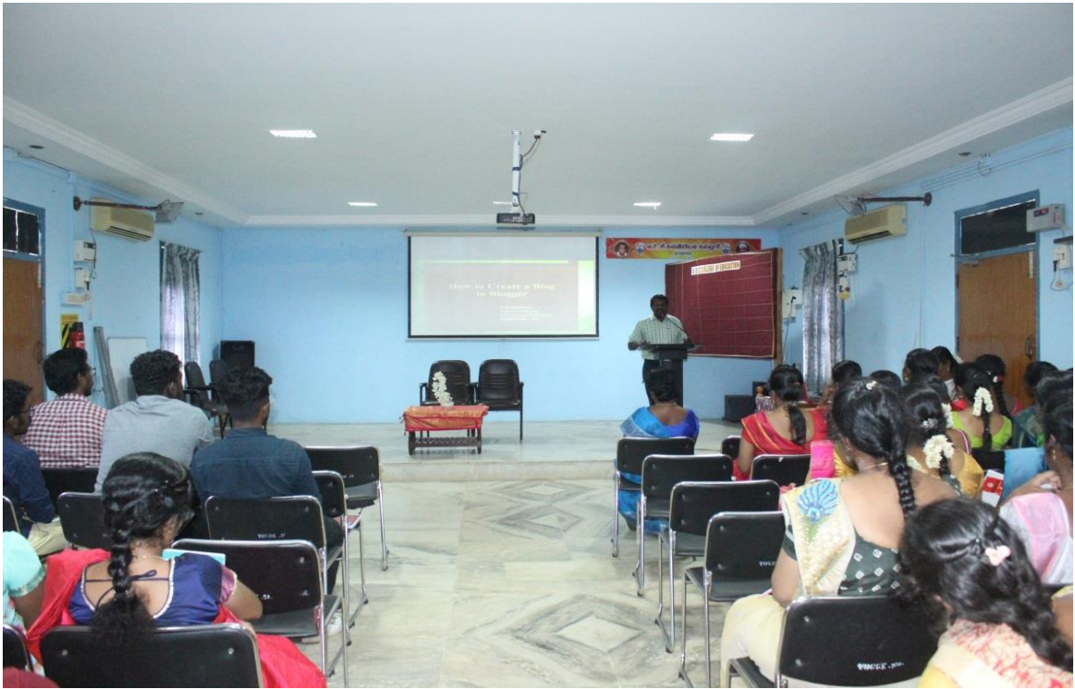
Workshop on “How to Create Educational Blogs in Blogger (EduBlogs)” was conducted on 20.10.2023 for B.Ed. I Year students.