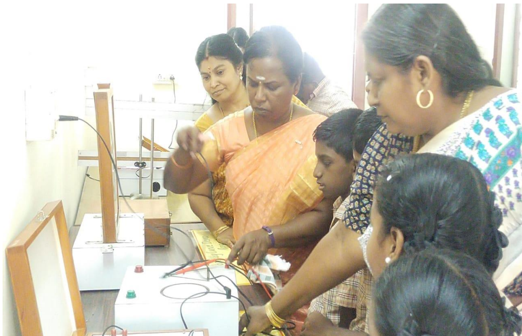
The Psychology Club and IQAC of our college conducted a two days “Workshop on Psychology Experiments for School Children” on 14.09.2023 and 05.10.2023