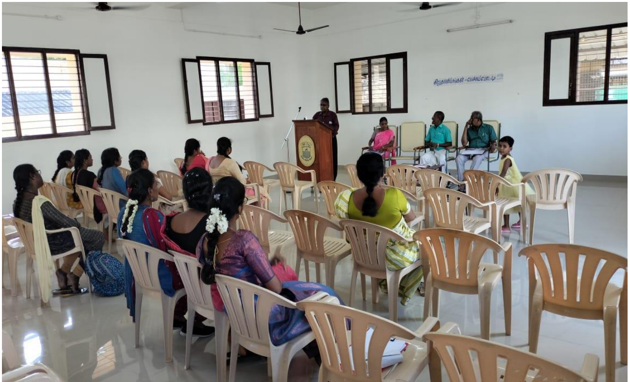
Thoothukudi District Civil Supplies and Department of Consumer Protection organized a District Level Inter Collegiate Elocution Competition titled “Millets” on 29.11.2023 in association with V.O.C.College of Education.