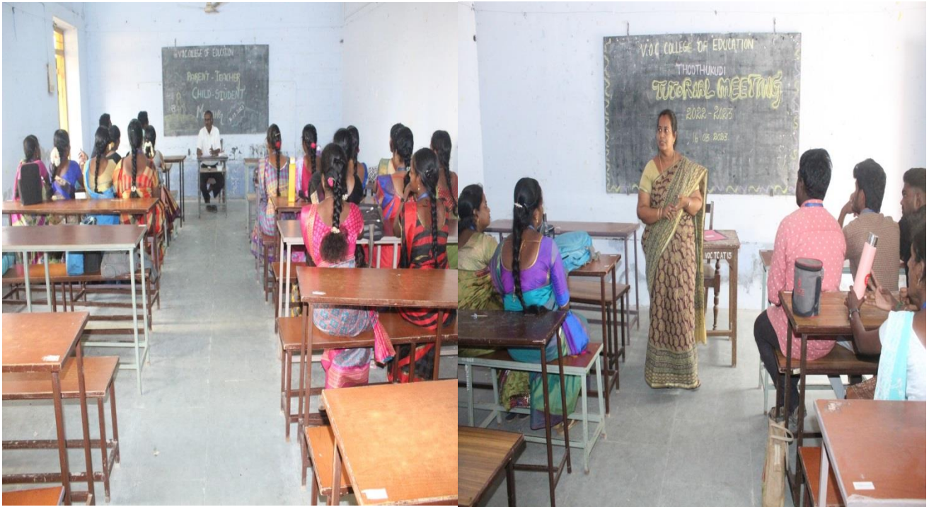
The Tutorial Group Meet for the B.Ed. II Year student-teachers was held in our college on 16.03.2023.