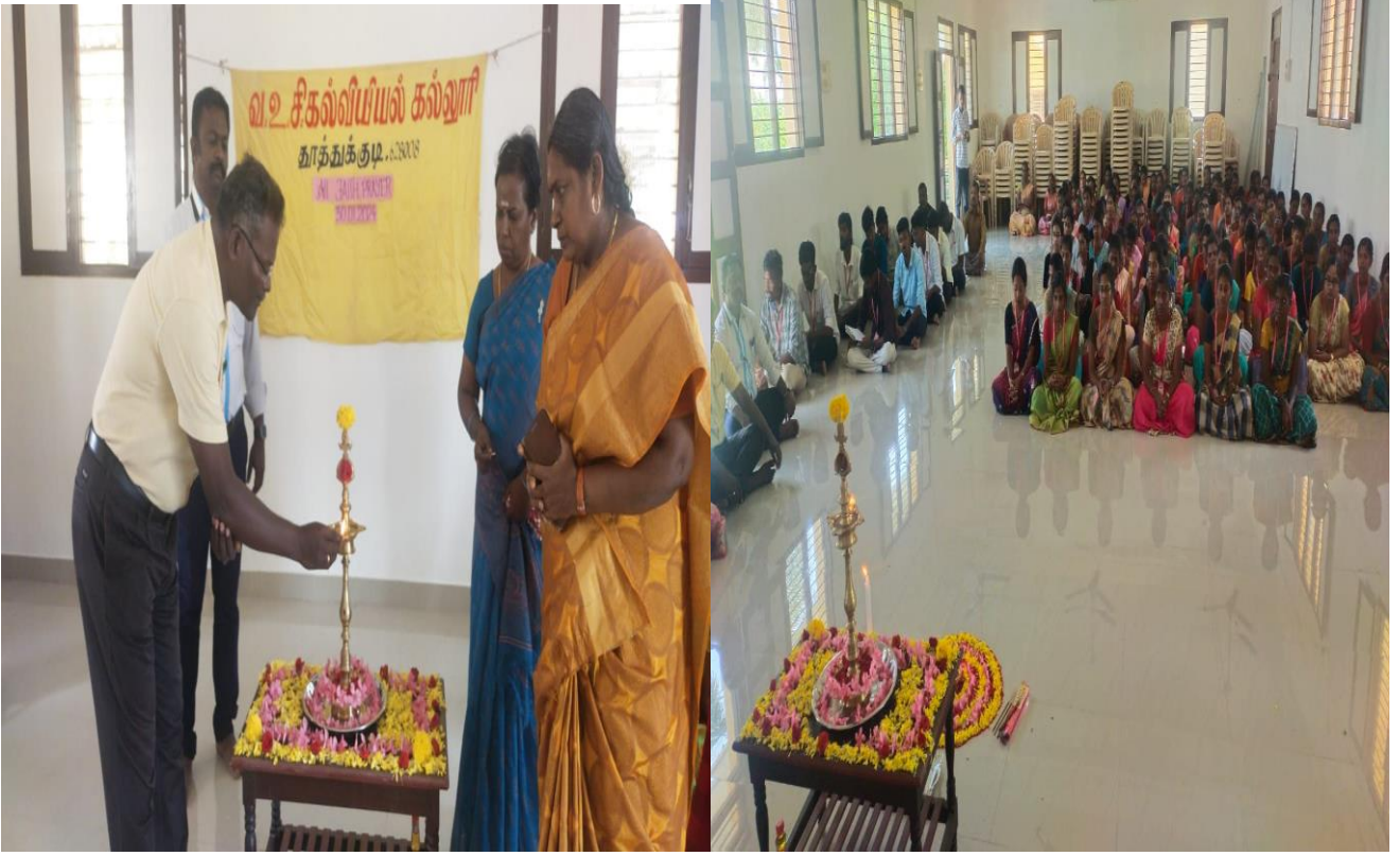
“All Faith Prayer” on account of Martyr’s Day was observed on 30.01.2024.