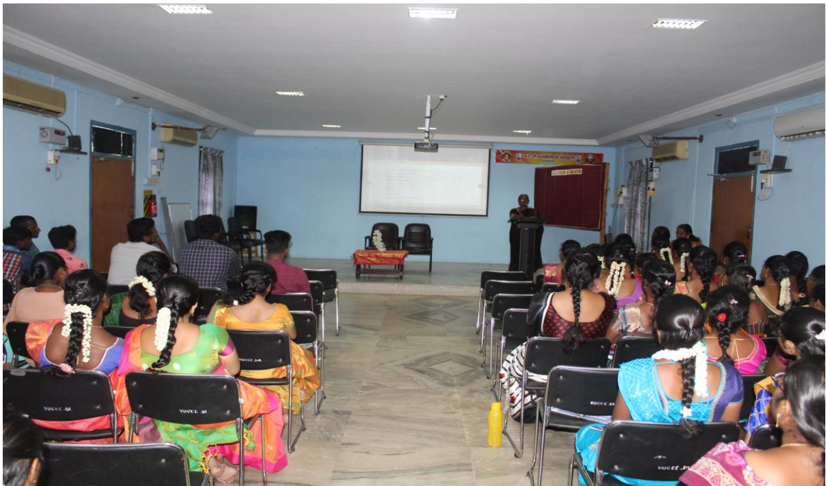
Library Orientation was held on 18.10.2023 for B.Ed. I year students.