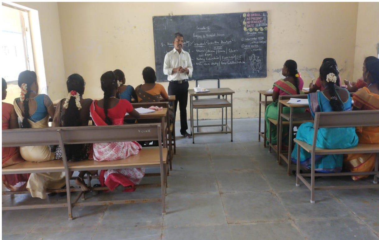
Second Semester Orientation for B.Ed. First year student – teacher was held on 12.02.2024.