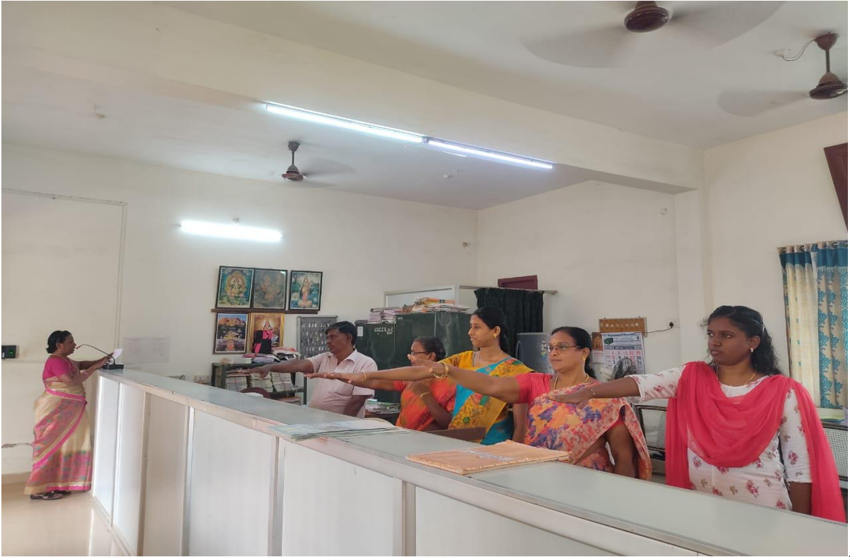
Pledge was taken by students and staff of our college on account of Sardar Vallabhbhai Patel's birth anniversary which is marked as National Unity Day on 31.10.2023.