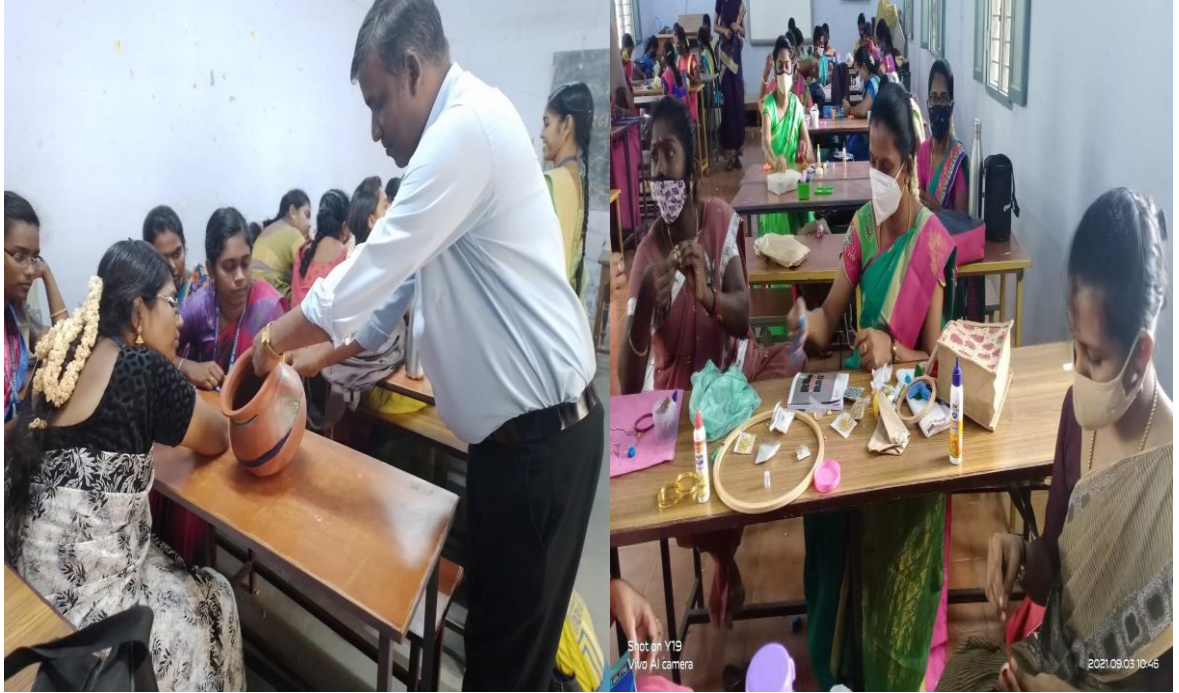
எமது கல்லூரியில் பயிலும் மாணவர்களுக்கு அவர்களது தனித்திறன், படைப்பாற்றலை வளர்க்கும் விதமாக மார்ச் 13, 2023 தொடங்கி ஏப்ரல் 6, 2023 வரை நுண்கலைப் பயிற்சிகளான ஓவியக்கலைப் பயிற்சி (டெரகோட்டா) களிமண் பொம்மைகள் செய்தல், (ஓரிகாமி) காகித உருவங்கள் செய்தல், இயற்கைப் பொருட்களில் கலைப் பொருட்கள் செய்தல் போன்ற பயிற்சிகள் அளிக்கப்பட்டது.