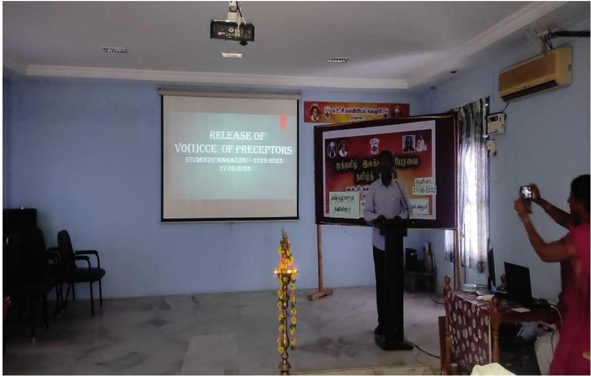
The Students' Magazine, "Voice of Preceptors" for the year 2022-2023 was released on 27.06.2023.