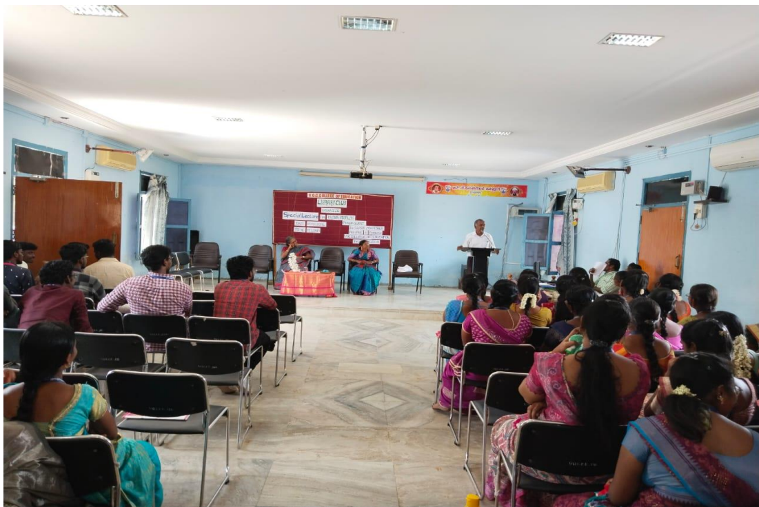
Library Club of our college organized a Special Lecture on “கற்க கசடற” on 27.02.2024.