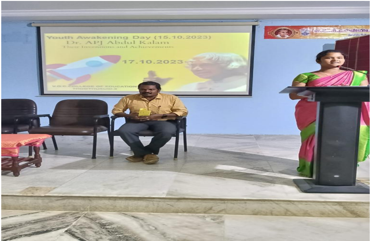
On account of Dr.A.P.J. Abdul Kalam's birthday our college organized Youth Awakening Day on 17.10.2023.