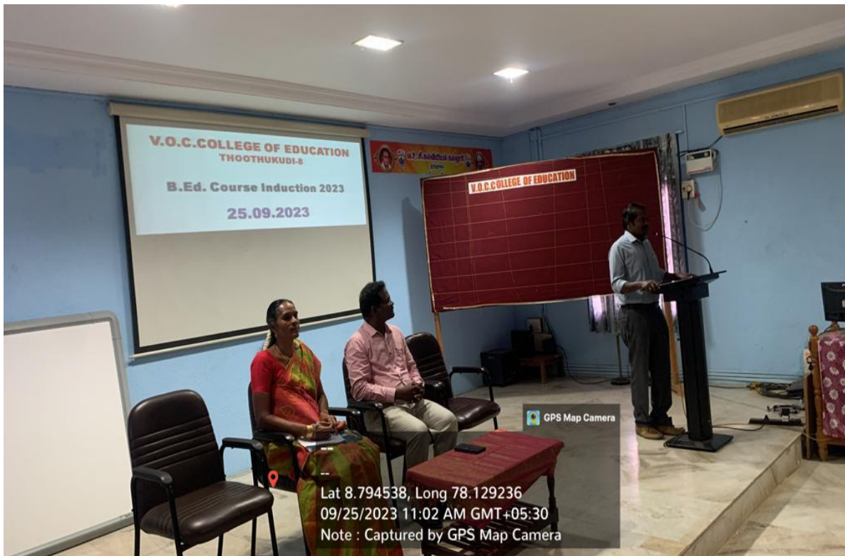
Course Induction Programme for B.Ed. I year students was held on 25.09.2023.