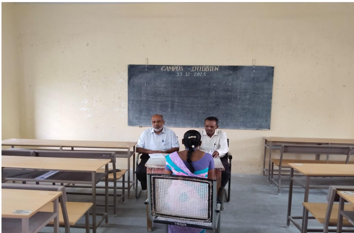
The On Campus Interview was conducted by our college for recruiting Part Time Faculty Members, Female Counsellors, Tutor and Co-ordinator to JEENIUS – A Premier Institution for NEET/IIT-JEE, Thoothukudi on 13.12.2023.