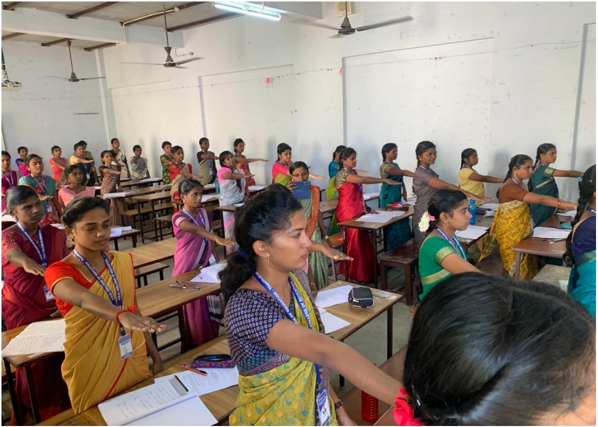
National Voters Day was celebrated in our college by taking pledge by our staff and students on 24.01.2024.