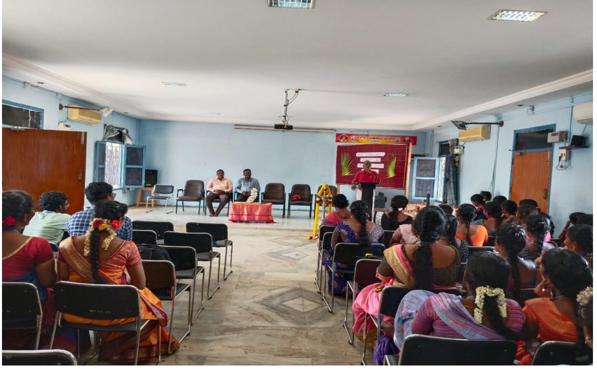
வ.உ.சி. கல்வியியல் கல்லூரியில் 21.02.2024 அன்று உலகத்தாய் மொழி தினம் கொண்டாடப்பட்டது.