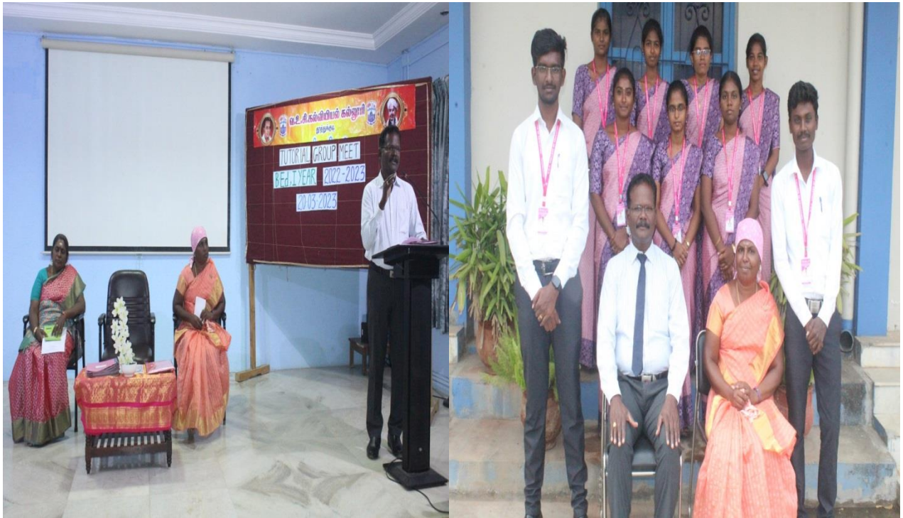
Our college organized the Tutorial Group Meet for the B.Ed., I Year student-teachers on 20.03.2023