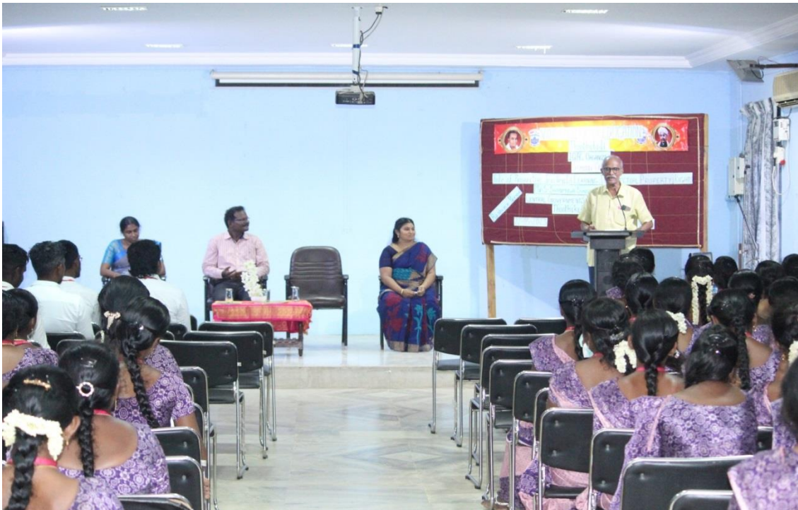
IQAC of our college organized a seminar on “Role of Prospective Teachers in Learning Intellectual Property Rights (IPR)” on 22.05.2023.