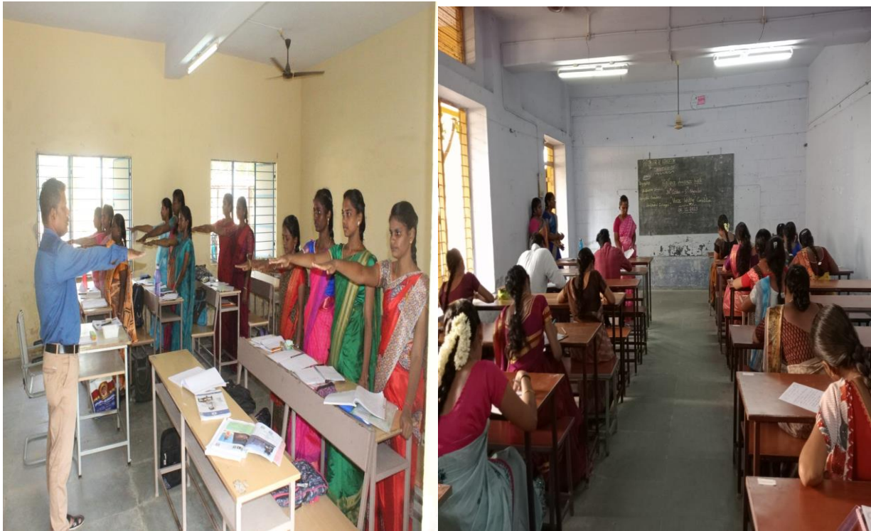
Oath Taking, Slogan Writing Competition and Verse Writing competitions were conducted on account of Vigilance Awareness Week from 30.10.2023 to 05.11.2023.