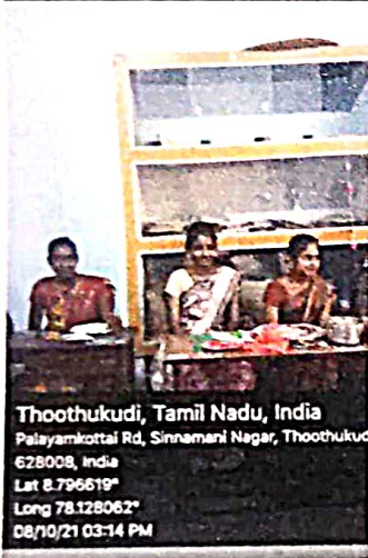
Thoothukudi, Tamil Nadu, India Palayamkottai Rd, Sinnamani Nagar, Thoothukudi 628008, India Lat 8.796619° Long 78.128062° 08/10/21 03:14 PM