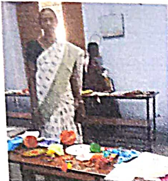
Thoothukudi, Tamil Nadu, India 2, Coats Nagar, Subbiah Puram, Thoothukudi, Ta India Lat 8.794795° Long 78.128945° 08/10/21 03:06 PM