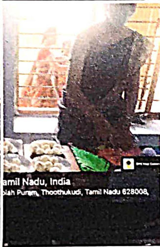
Thoothukudi, Tamil Nadu, India 1, Coats Nagar, Subbiah Puram, Thoothukudi, Tamil Nadu 628008, India