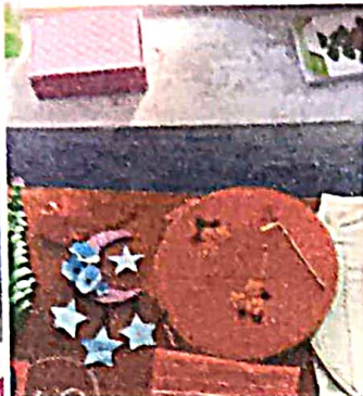
Thoothukudi, Tamil Nadu, India 1, Coats Nagar, Subbiah Puram, Thoothukudi, Ta India Lat 8.794419° Long 78.128686° 08/10/21 03:26 PM