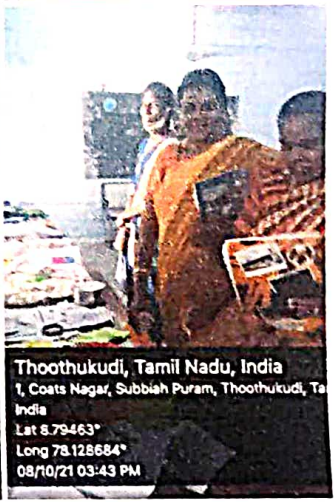
Thoothukudi, Tamil Nadu, India 1, Coats Nagar, Subbiah Puram, Thoothukudi, Ta India Lat 8.79463° Long 78.128684° 08/10/21 03:43 PM