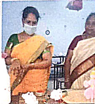
Thoothukudi, Tamil Nadu, India 2, Coats Nagar, Subbiah Puram, Thoothukudi, Ta India Lat 8.7947° Long 78.128961° 08/10/21 03:45 PM