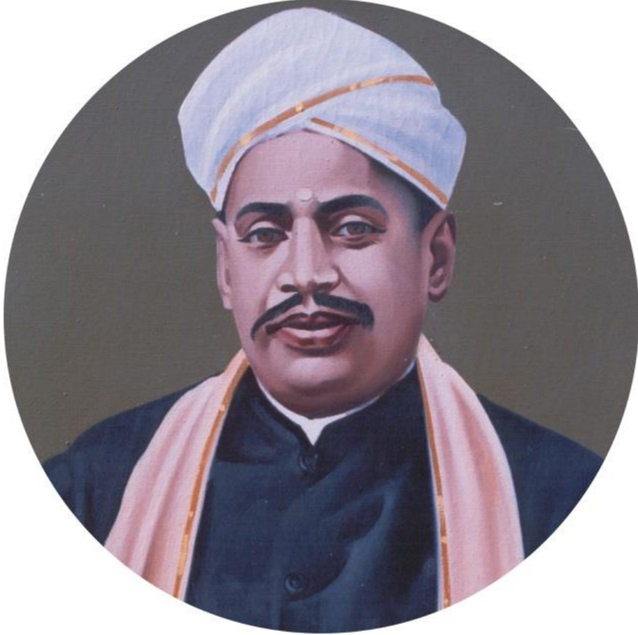
கப்பலோட்டிய தமிழன் வ.உ.சிதம்பரனார்

“என் மனமும், என் உடம்பும், என் சுகமும், என் அறமும், என் மனையும், என் மகவும், என் பொருளும், என் மதியும், குன்றிடினும் யான்குன்றேன், கூற்றுவனே வந்தாலும் வென்றிடுவேன், காலால் மிதித்து”